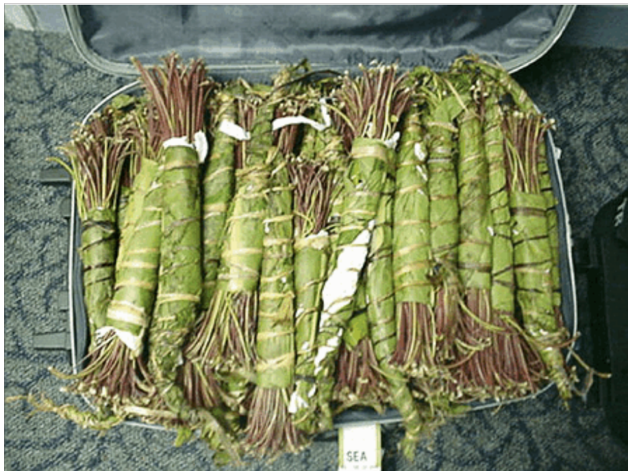
Khat Wrapped in Banana Leaves and Smuggled in a Suitcase

Khat also is transported into the United States by couriers aboard commercial aircraft. Khat smugglers in Great Britain frequently attempt to recruit couriers who are not of African or Middle Eastern origin, believing such individuals are subject to less scrutiny when entering the United States.