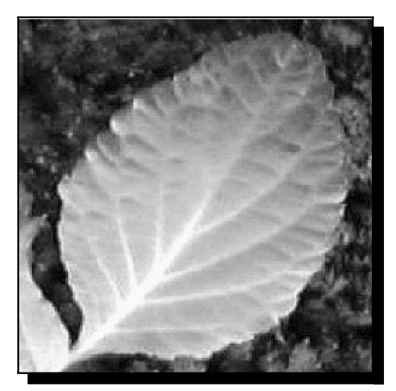
Salvia divinorum leaf.

example, abusers may describe hearing colors or smelling sounds. The hallucinogenic effects generally last 1 hour or less unlike other hallucinogens like LSD and PCP. High doses of the drug can cause unconsciousness and short-term memory loss.