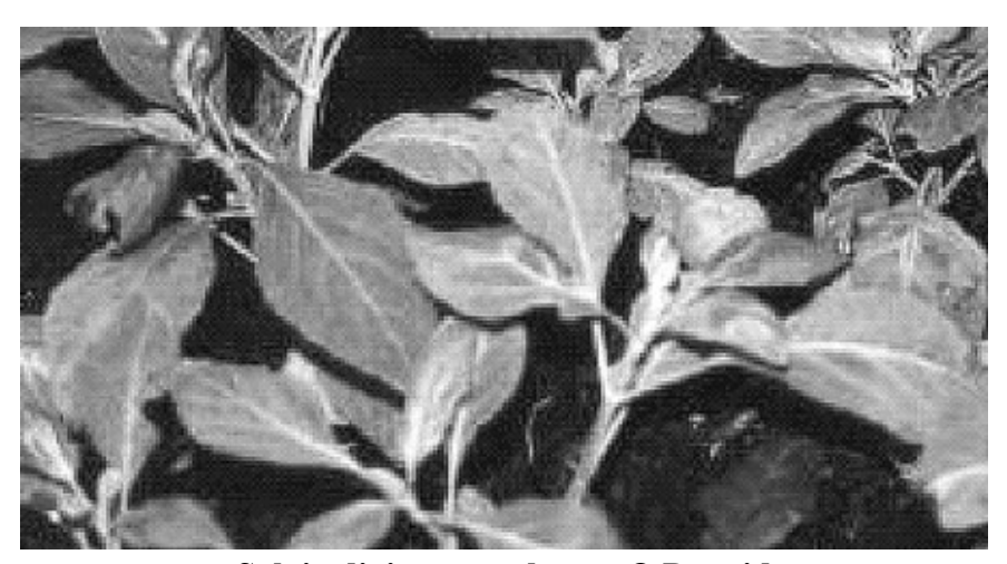
Salvia divinorum plants.

Salvia divinorum most often is distributed via the Internet and at some "head shops" in California, Hawaii, Missouri, New York, Washington, and Wisconsin. Prices for Salvia divinorum vary widely but are generally higher for plants grown in Hawaii and Sierra Mazateca (Central Mexico). An ounce of Salvia divinorum leaves sells for $15 to $120 while Salvia divinorum plants generally sell for $20 to $45 each. Liquid extract of Salvia divinorum-produced by crushing the leaves of the plants and using solvents to extract Salvinorin A--sells for $110 to $300 per ounce. Purchased primarily via the Internet, Salvia divinorum is transported to customers via package delivery services.