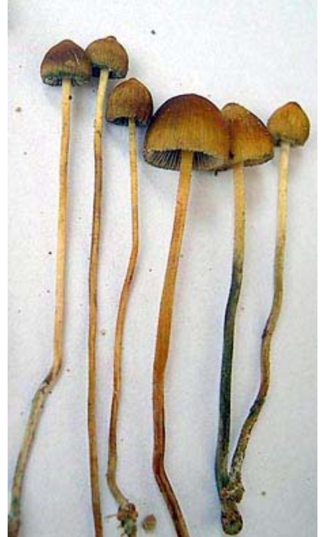
Psilocybe antioquensis - Angkor Wat Cambodia