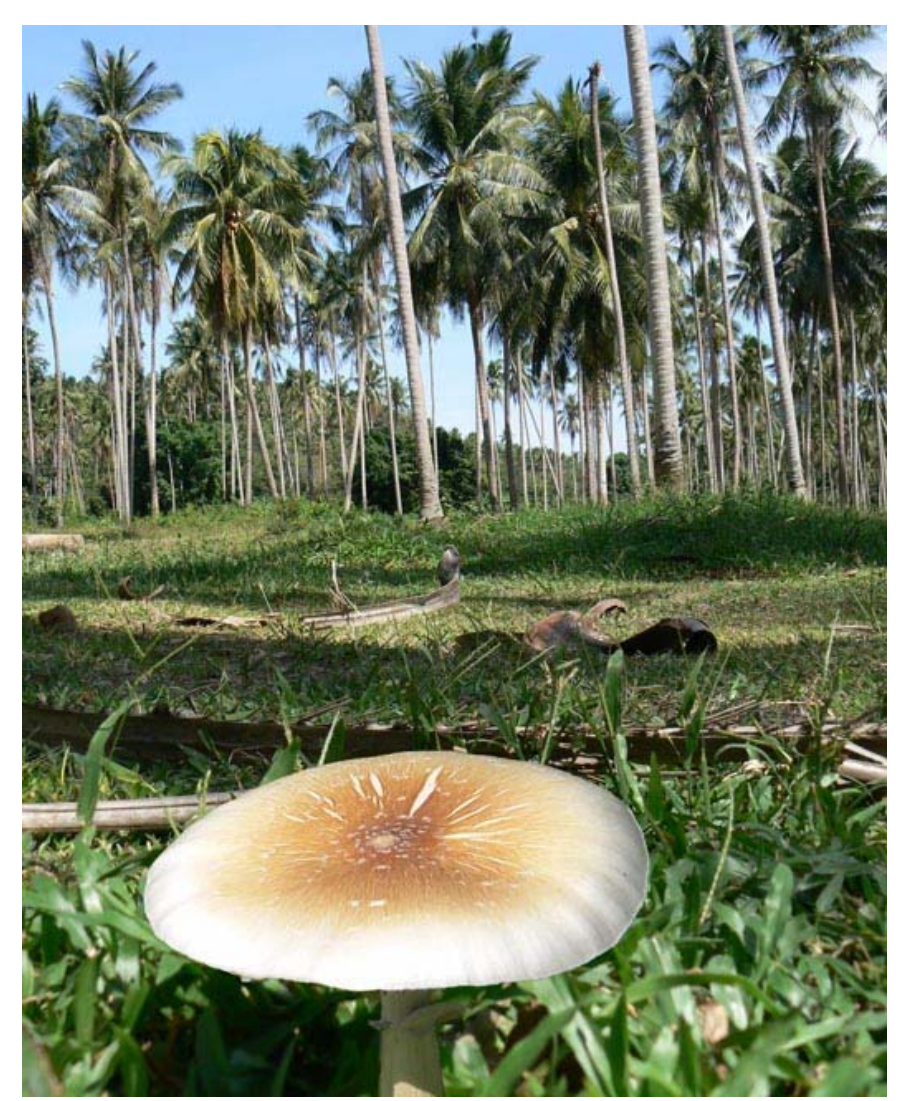
<u>Psilocybe</u> <u>cubensis</u> (Earle) Singer