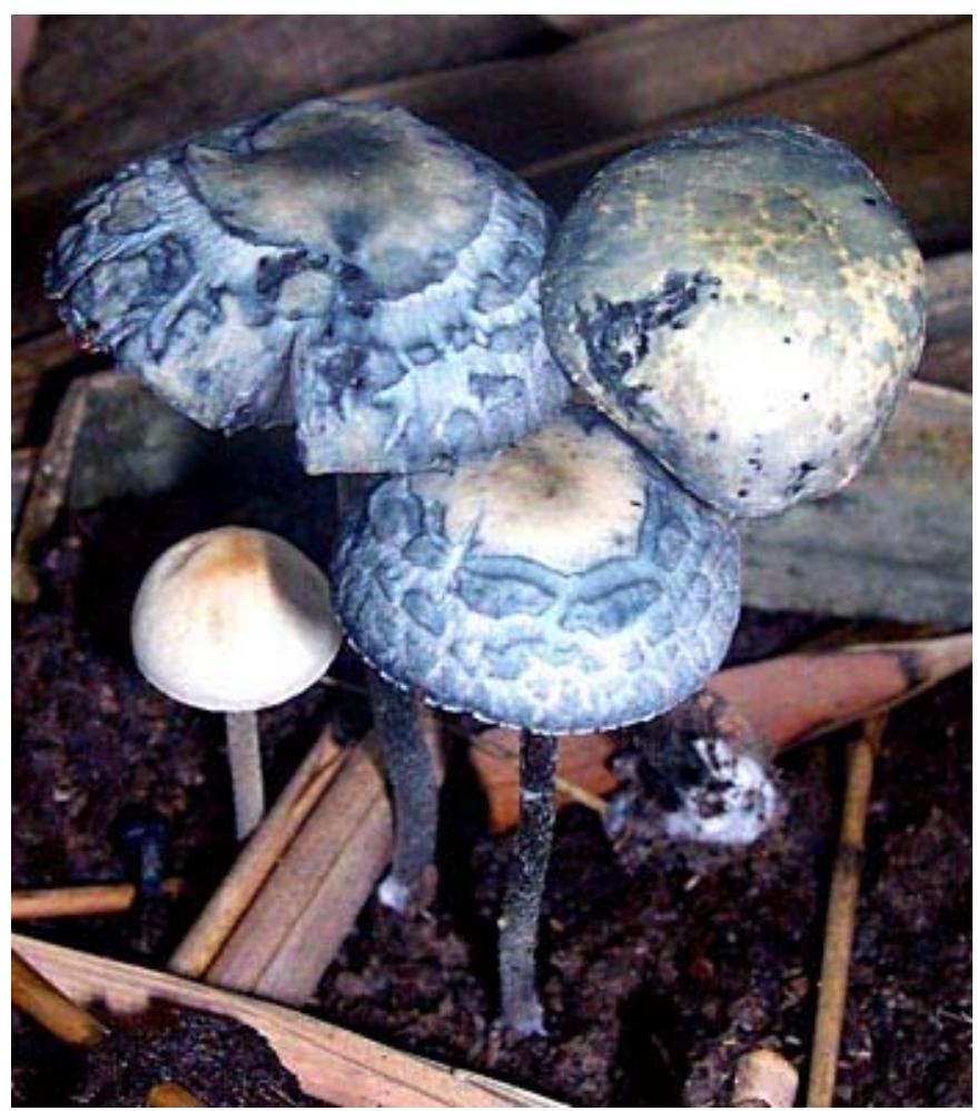
Natural Bluing in Copelandia cyanescens At Ban Nathon, Koh Samui, Thailand, Monastery