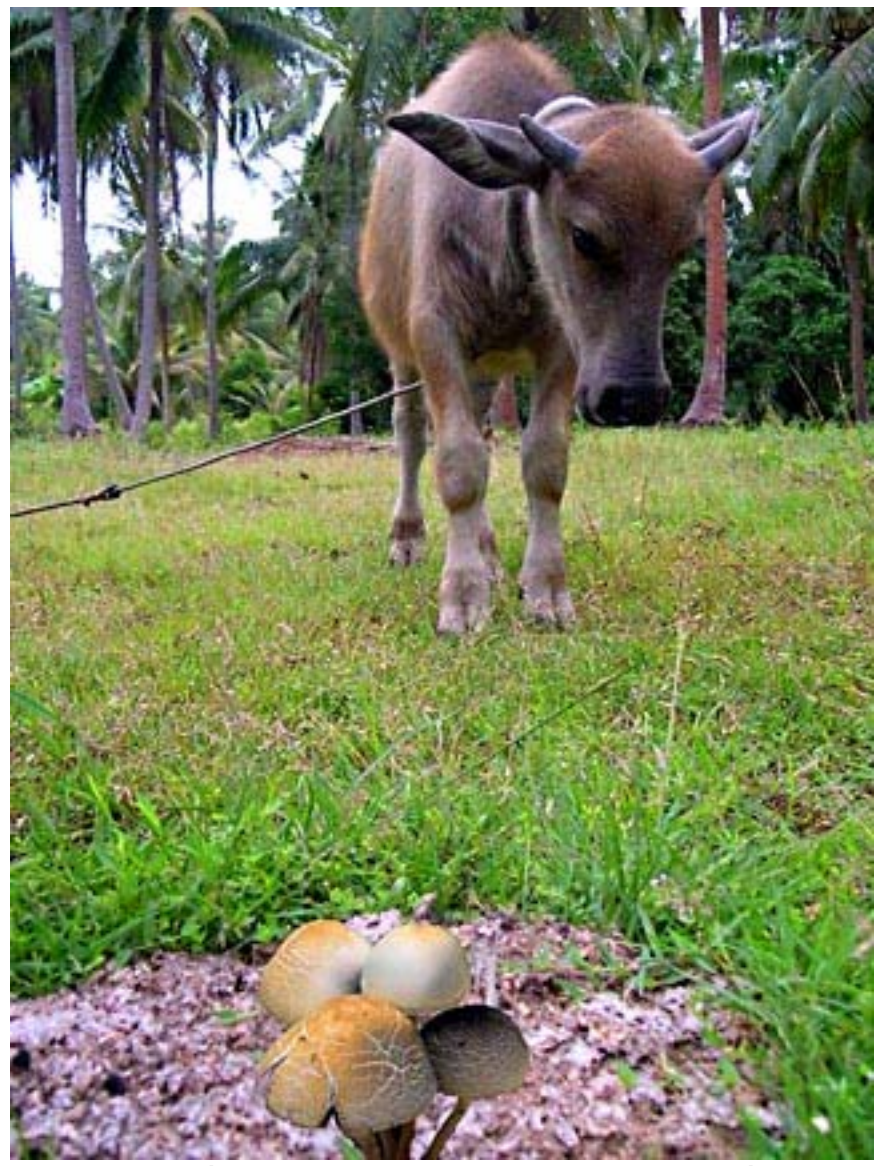
Copelandia cyanescens (Berk. & Br.) Singer Ban Phang Ka, Koh Samui, Thailand.