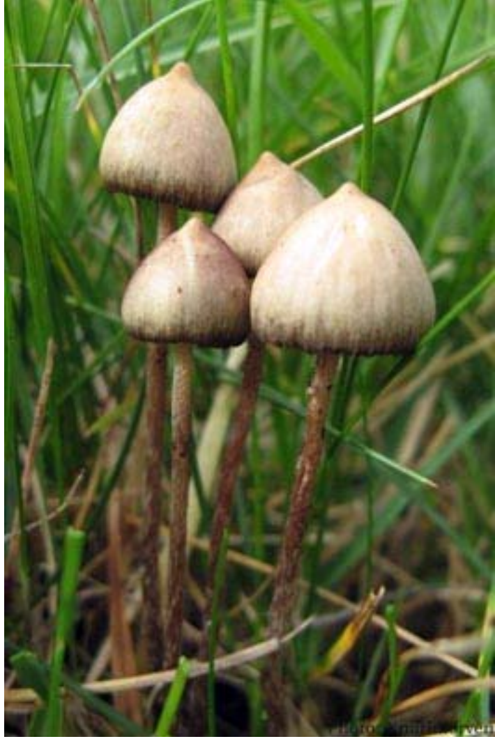
<u>Psilocybe</u> <u>semilanceata</u> (Fr.:Secr.) P. Kumm.