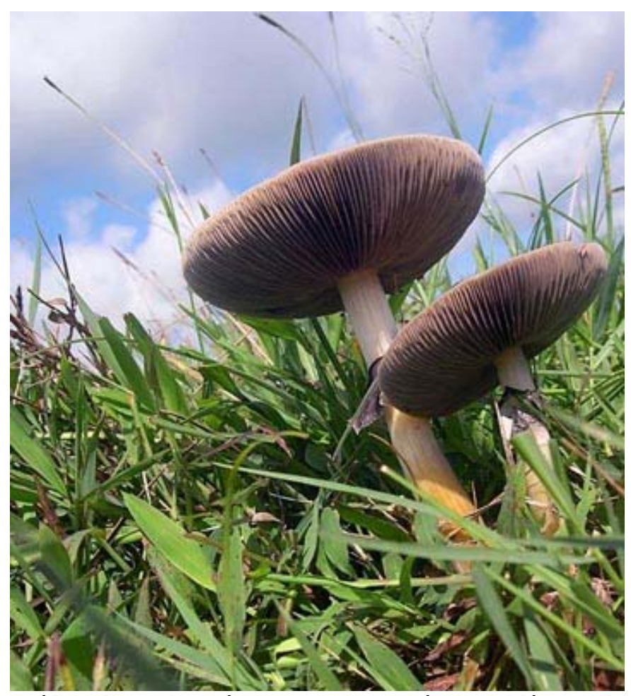
Psilocybe cubensis - Na Muang Rice Paddie, Koh Samui, Thailand