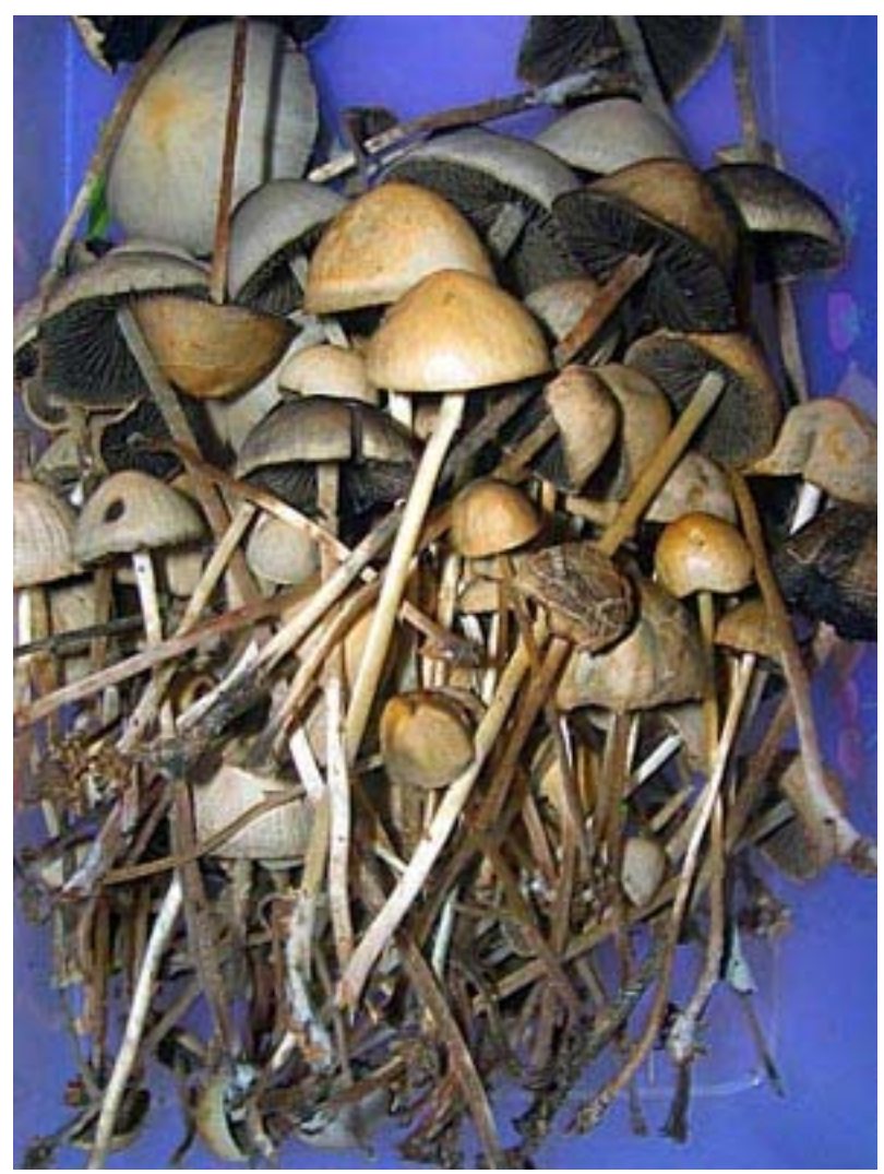
One Half hour of picking Copelandia cyanescens at the Ban Thurian Buffalo (Kwai) Arena. Koh Samui, Thailand.