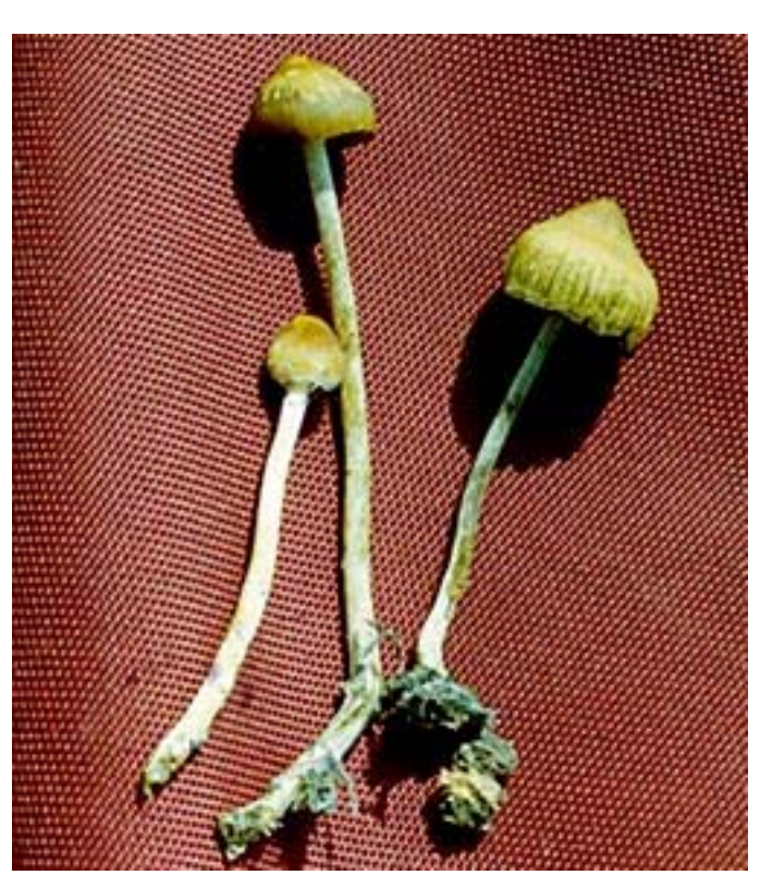
Fig. 1. Psilocybe samuiensis Guzmán, Bandala & Allen.