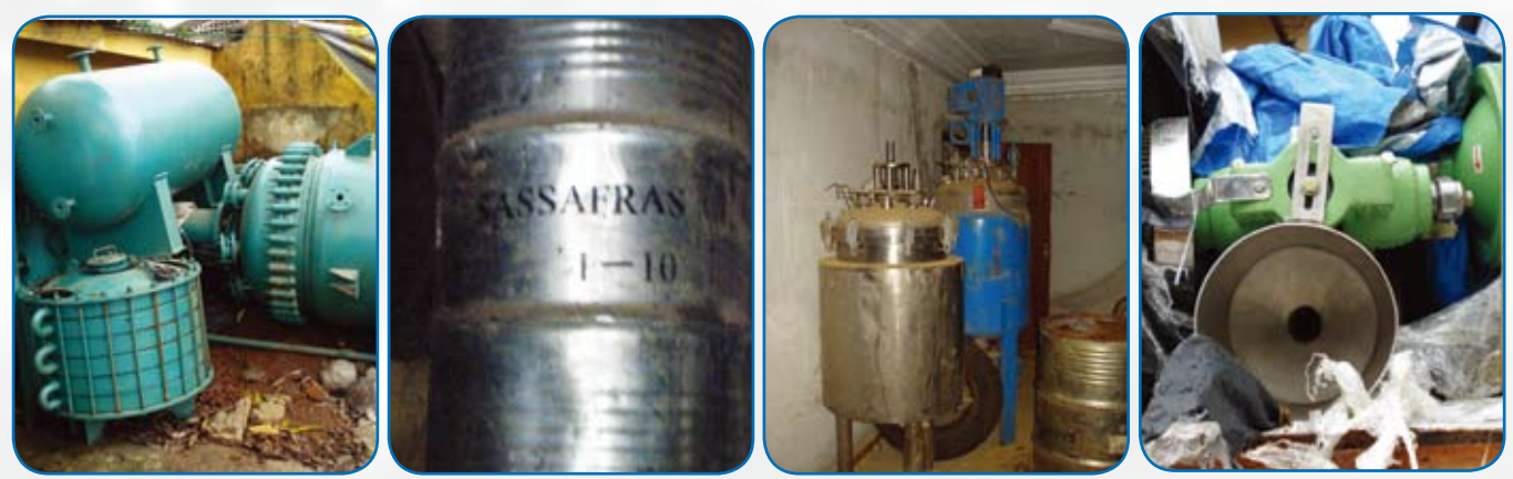
High Capacity Pressure Vessel

At two locations in Guinea Conakry (see story #25), over 5000 litres of sassafras oil and 80 litres of 3,4-MDP2P precursors for synthesizing MDMA were found. Forensic analysis confirmed the presence of MDMA in a high pressure reaction vessel found at Kissosso. Four industrial-sized high pressure chemical reaction vessels were also found at the second site, Cite de lair, along with quantities of sassafras oil. It is still unclear if these had been relocated from manufacturing site(s) within Guinea or from outside. However, the seizure of chemical precursors of MDMA, the presence of industrial- scale high pressure reaction vessels and strong forensic evidence linking machinery and precursors to an intention to synthesize MDMA presents a worrying prospect for Governments in Africa who are not prepared for a new front in the battle against drugs. This, more than ever before, raises the need for a truly global effort to address the synthetic drugs problem.